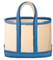
OVER-SIZED TOTE BAG