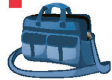
MEDICALLY NECESSARY BAGS*

*MEDICAL SUPPLIES WILL BE PERMITTED AFTER PROPER INSPECTION.