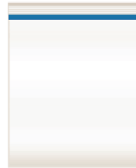
1-GALLON PLASTIC FREEZER BAG