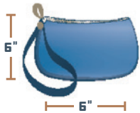
BAGS SMALLER THAN 6" X 6" X 6"