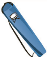
FOLDING CHAIR BAG (FOLDING CHAIRS PROHIBITED)